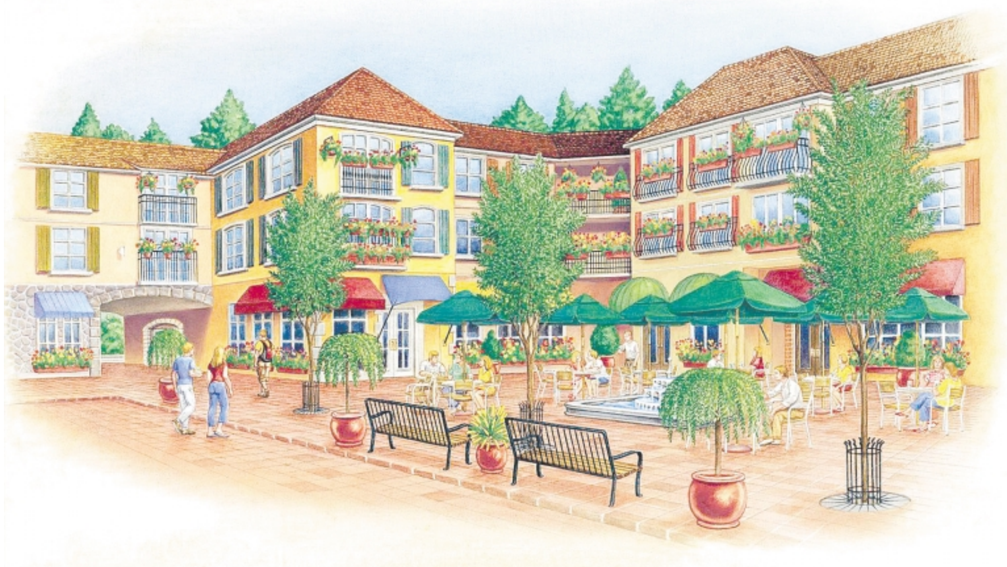
Tuscany Village Residences, in the 1600-block of McKenzie Avenue in Saanich, will feature condominiums with Juliet balconies, tiled roofs, cobblestone, a roof-top garden and piazza.