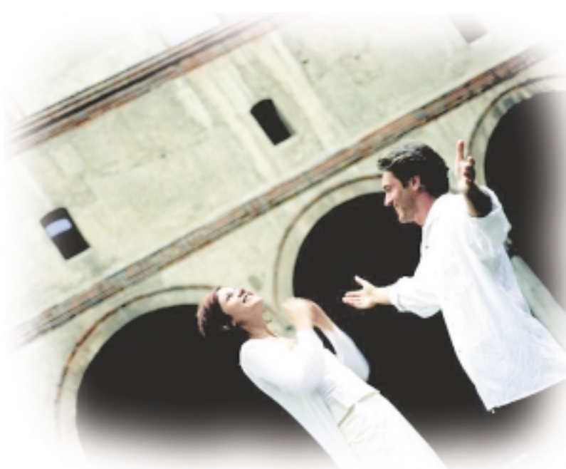
Tuscany Village will feature a large piazza with fountain where residents will be able to sit outside at Starbucks and enjoy a coffee.

The development's anchor tenant is Thrifty Foods, which expects the new store to be one of its most successful locations, together with Milestone's restaurant, Starbucks, IDA Pharmacy, a boutique liquor store and medical-